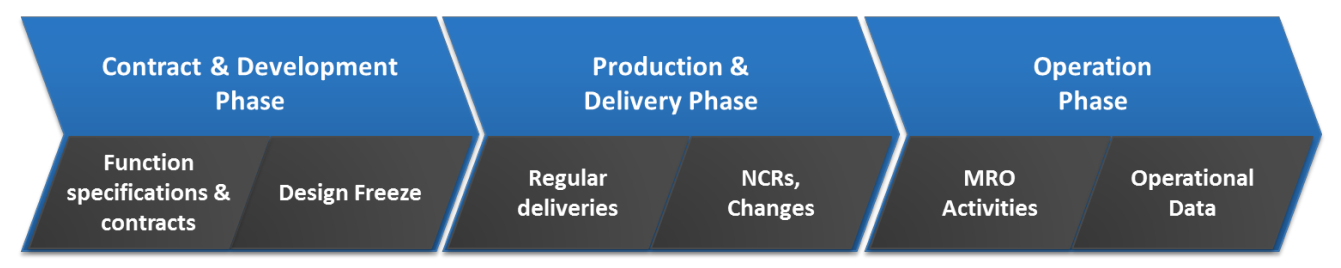
Figure 5-1 Data exchanges during lifecycle of rolling stock

Table 5-1 Rolling stock visibility events