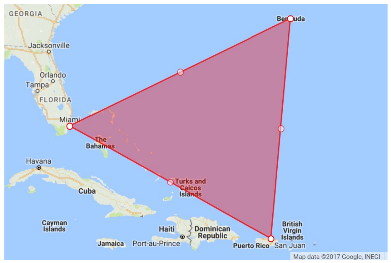
Example 6-5 Geofence polygon (Bermuda Triangle) rendering in Google Maps