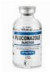
Base Unit GTIN 00303386045376