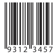
Figure 2 EAN-8 Bar Code