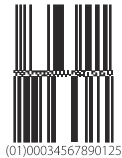
Figure 7 GS1 DataBar Stacked Omnidirectional Bar Code

There are seven different types of GS1 DataBar Bar Codes four of which are omnidirectional and can therefore be scanned at Point-of-Sale; one of these, GS1 DataBar Stacked Omnidirectional, is illustrated below. GS1 DataBar has been approved for bilateral use between trading partners from 2010. In 2014 GS1 DataBar becomes an open symbology and all scanning environments must be able to read these symbols.