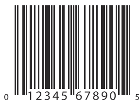
Figure 3 UPC-A Bar Code