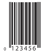
Figure 4 UPC- E Bar Code