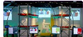
Above: Interactive SCKC training facility.

Take a 30 minute journey of discovery through a life size logistics supply chain and see how the GS1 System can streamline your business processes; from raw materials to the consumer.